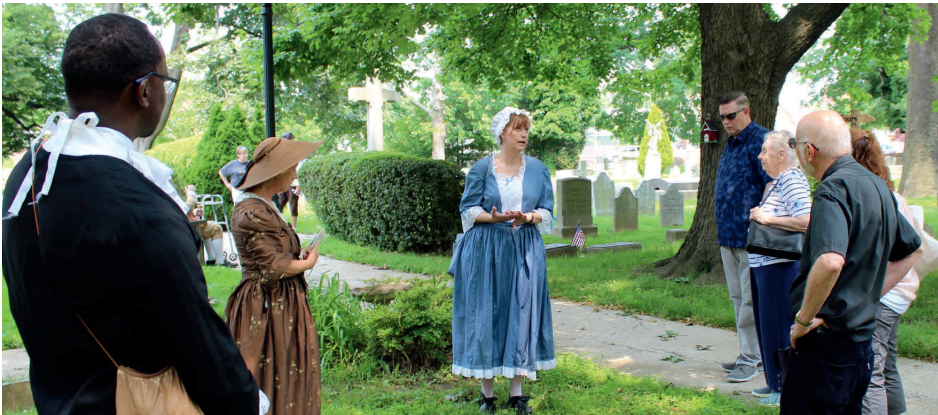
Historic Trinity Church Oxford, which traces its roots back to at least 1698, held its first graveyard tour this summer. Participants (left and next page) dressed in authentic period wear.

By speaking for the dead, graveyard tours are a creative way to bring to life the history not only of the church and its people, but of the broader community the church serves. It may strike some as offbeat, but graveyard tours offer a creative way to do community outreach, evangelism, and fundraising. ▶